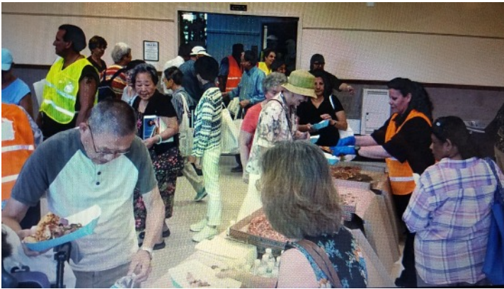
Earthquake Expo, like all successful events, attracted a large crowd. More than 300 attendees stayed past noon and were served pizza at lunchtime.

A bright eye-catching poster (below) placed at the PAC entry made it easy to find out what to see and do during the Expo. Another poster (right) acknowledged and credited the generosity of Expo contributors, most of whom are active Laguna Woods Amateur Radio Club members.